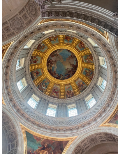
Paris: Les Invalides