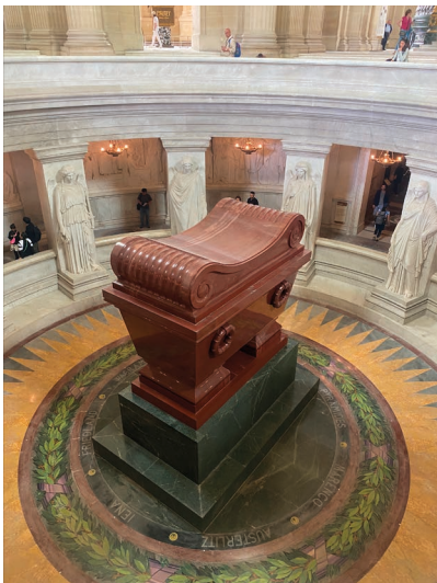
Paris: Les Invalides