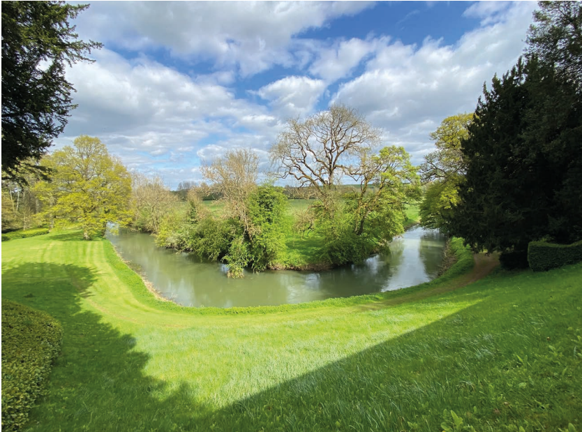
Rousham Gardens