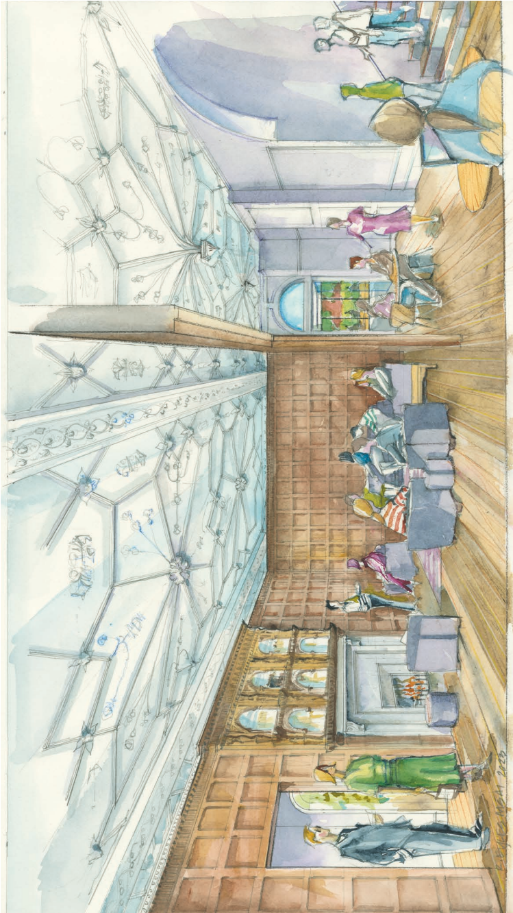
Mock up of the Panelled Room, Frewin Hall, as it will be after the current refurbishment work