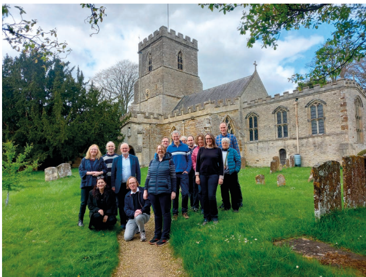
Top: Rousham Gardens; Bottom: Steeple Aston Church