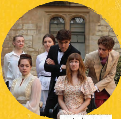
Garden play: The Importance of Being Earnest