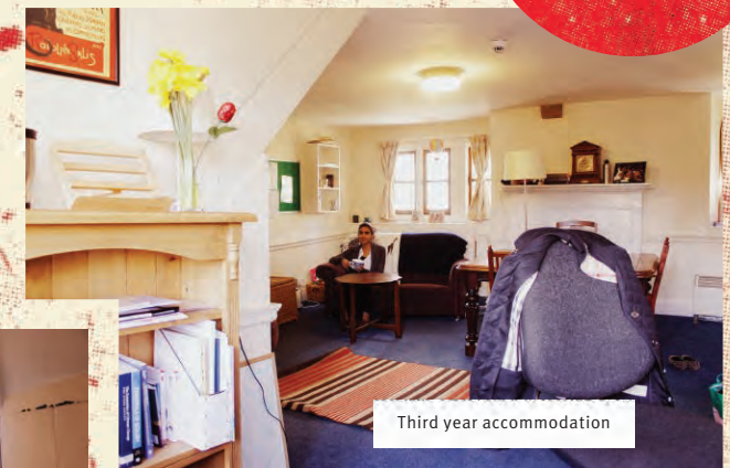
Third year accommodation

The third years get the first pick of college and Frewin rooms so that they have the best rooms for their final exams. Many of the third year rooms are sets rather than single rooms, which contain a bedroom and study/living room and en suite facilities in some.