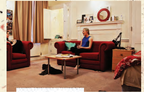
Second year room

In second year everyone lives in our college annex, Frewin. Unlike most of the other colleges our annex isn't miles out of town - in fact it is practically more central than the main site! It is just behind the Oxford Union building, off Cornmarket street and less than a five minute walk away from the main college site.