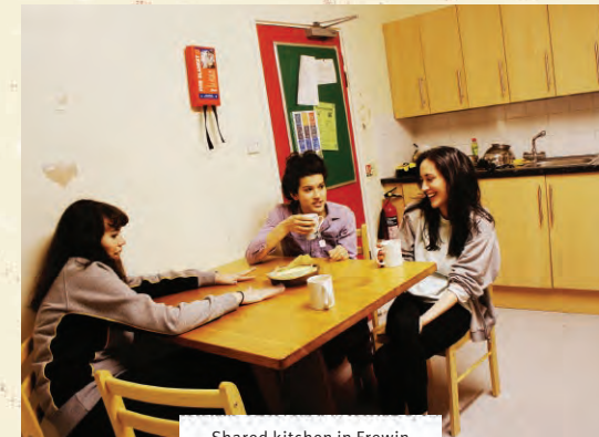
Shared kitchen in Frewin