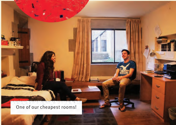
One of our cheapest rooms!