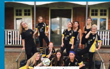
Women's football team

Brasenose has its own sports facilities with its own boat club, said to be the oldest in the world and its own sports ground (including tennis courts, cricket pitches and football/rugby pitches) within five minutes of college. Brasenose also gives its members free membership to the University Gym and squash courts at the Iffley Road complex. The University Gym has facilities that far exceed that of any college gym, so it's a great option for those who want to keep fit.