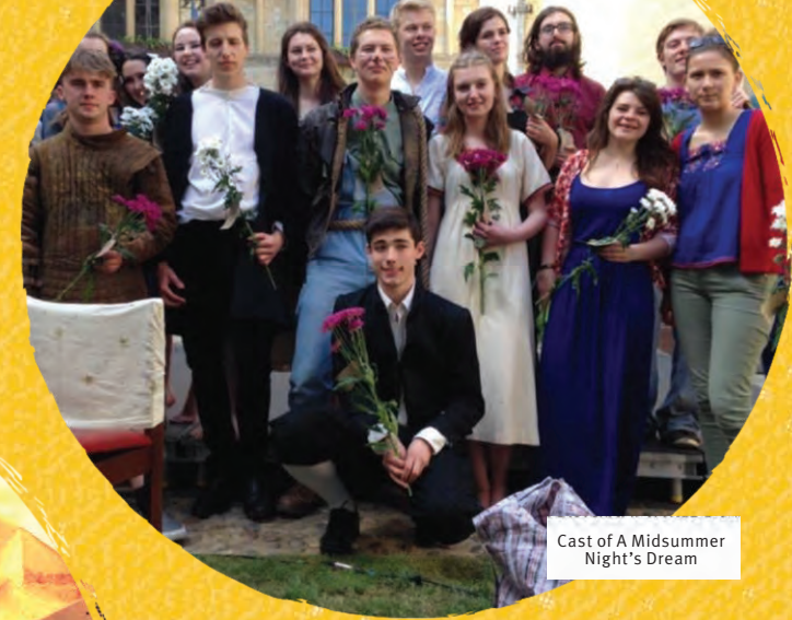
Cast of A Midsummer Night's Dream