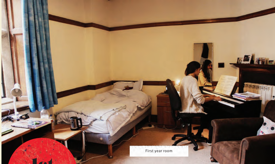
First year room