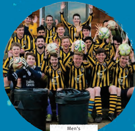
Men's football team