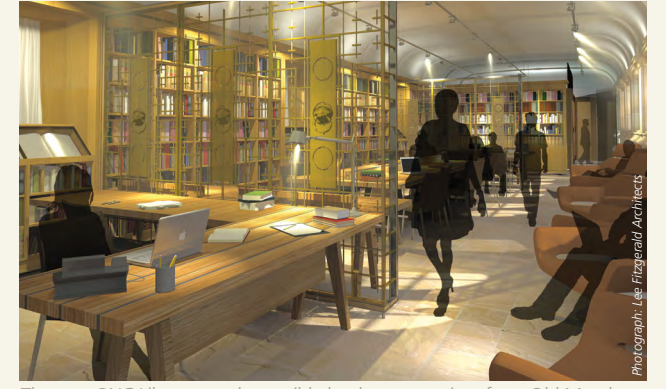
The new BNC Library; made possible by the generosity of our Old Members.

We think particularly of a landscape in which the College's staff and alumni play a very vital and prominent role. More than a decade ago the College commissioned an expert survey of Old Members and was given to understand that Brasenose has an exceptionally loyal group of alumni even by Oxford college standards. We have both had the pleasure and privilege of meeting many hundreds of our Old Members in the past few years and that verdict has been reinforced many times over, frequently in the simple statement 'I love this place'. Well-meaning sentiments about the value and importance of education are easy to produce, but willingness to help provide the resource which underpins education of the highest quality is a rarer and infinitely more precious commodity. We have received it unstintingly from our alumni in the past few years, in the form of