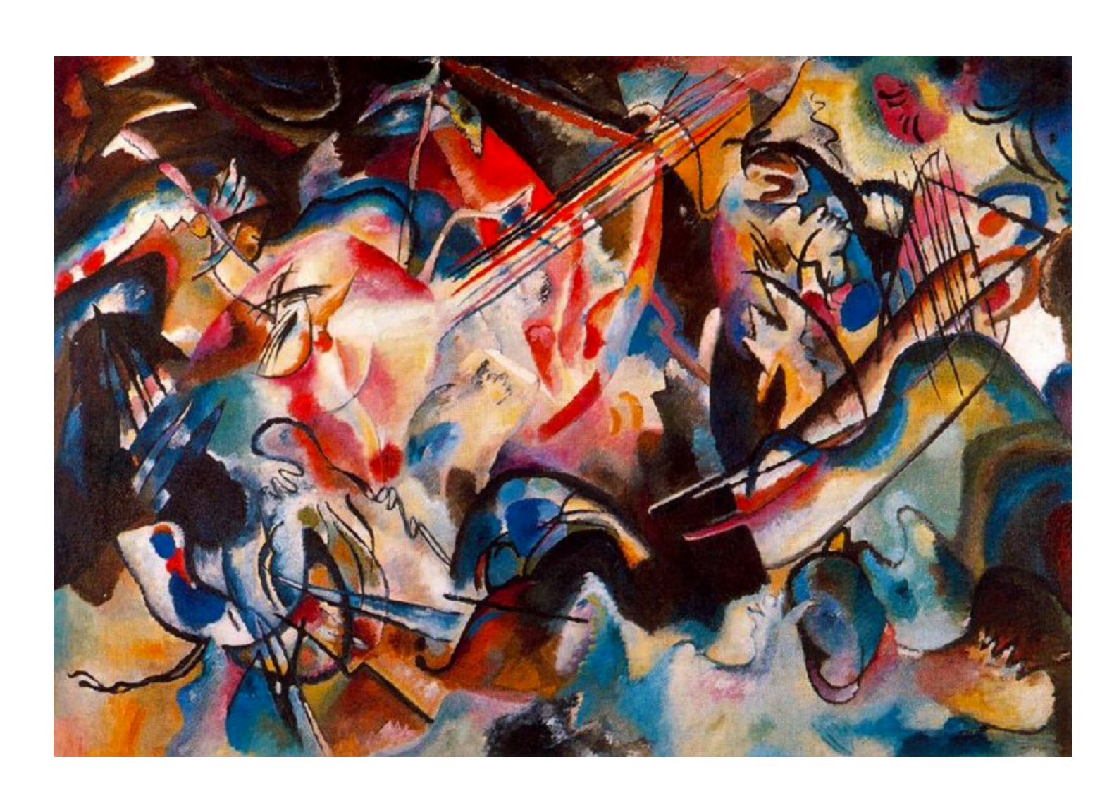
Hilary Term 2018