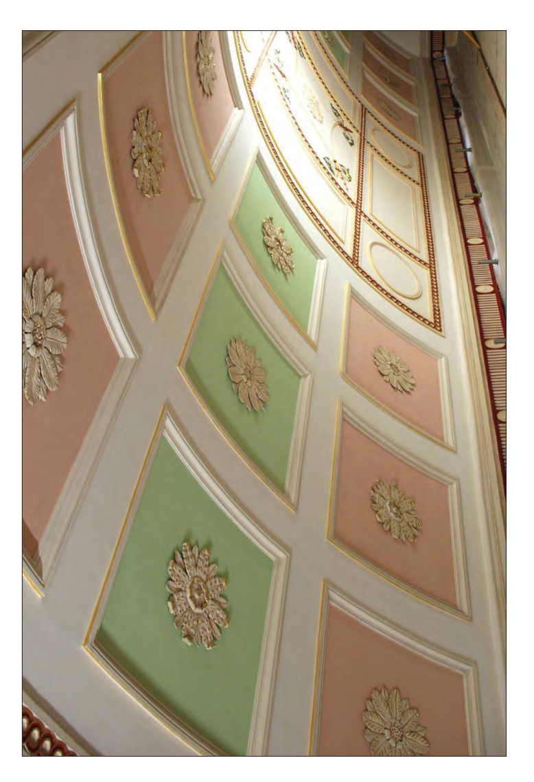
As part of the ongoing library renovations, the paintwork on the main library barrel vault ceiling was cleaned and restored. The completed library is scheduled to be reopened in Michaelmas Term 2017.